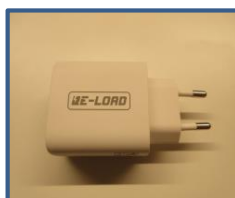
Foto del artículo Picture of the item

El objeto descrito se ajusta a la legislación pertinente de armonización de la Unión: